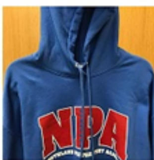
Sweatshirt, Hoody, Retro - Blue