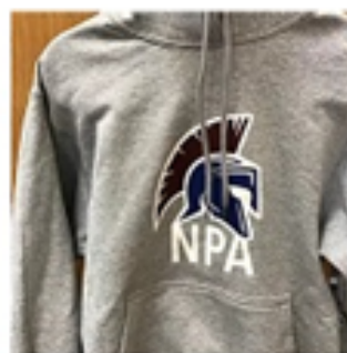
Sweatshirt, Hoody - Grey