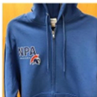
Sweatshirt with Zipper - Blue