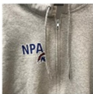
Sweatshirt, Zipper - Grey