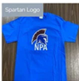
Short Sleeve T-Shirt - Blue

Upcoming CEC meetings via Zoom: Dec. 10 at 1 p.m. Jan. 19 at 1 p.m.