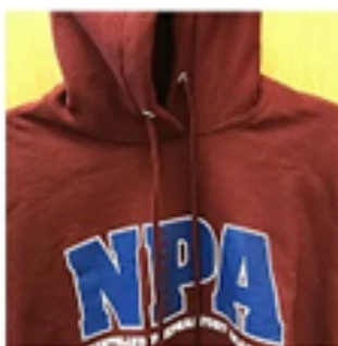
Sweatshirt, Hoody - Maroon