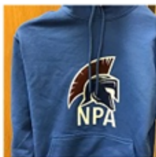
Sweatshirt, Hoody - Blue