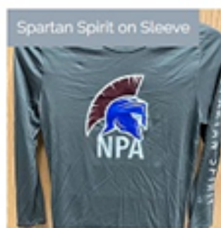
Long Sleeve Shirt - Grey